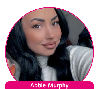
Recruitment Consultant - Cardiff Recruitment apprenticeship standards