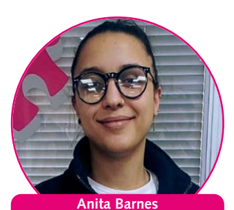
Recruitment Consultant - Preston Recruitment apprenticeship standards