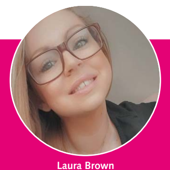
Branch Administrator - Staines Business Administration apprenticeship standards