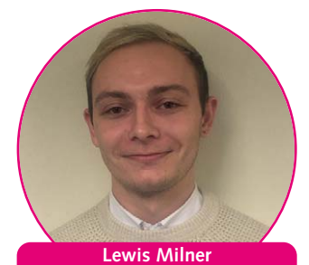
Recruitment Consultant - Chesterfiel Recruitment apprenticeship standards