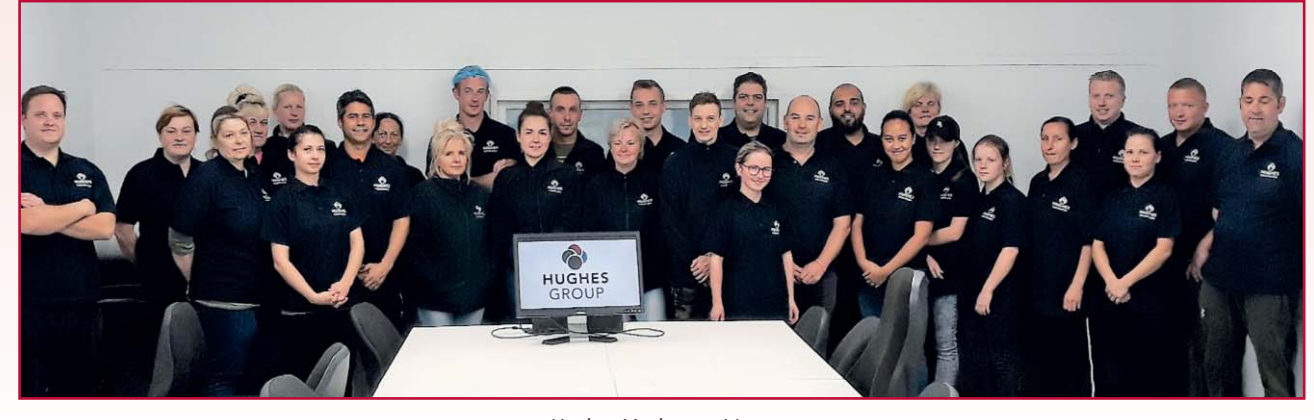
Hughes Mushrooms' team

"We have been really impressed with the service supplied by Bailey Employment Services. In this industry we rely on fast service and minimal disruption to our business when we introduce new staff. The team at Bailey's provide an outstanding service and always go the extra mile to ensure that we, as a client, are happy and the staff they provide are also happy. We have been delighted with the professionalism of Bailey's staff. They bring home the true meaning of 'service with a smile'."